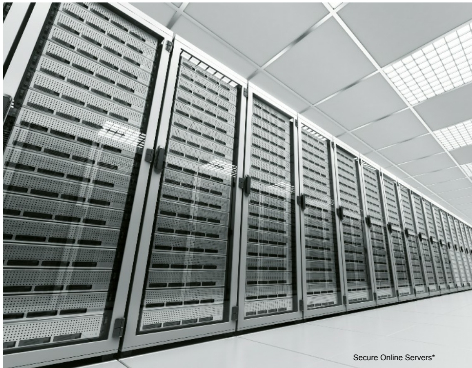
Secure Online Servers*

Markbook Online from SCOTT McDONALD PERSONAL COMPUTER SERVICES